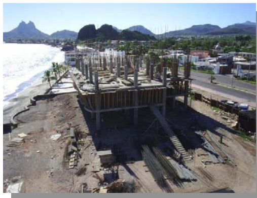
Below: From building A overlooking amenities and building C.