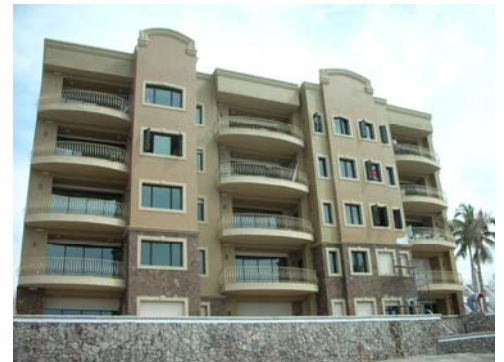
Above: Beach-side view of Building A