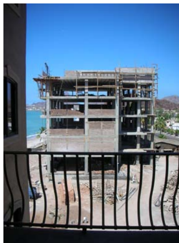
Right: View of Building C from Building A

The spa is in place and all of the grounds look fantastic. As you can see in the photo, Building C is progressing as well. Exterior walls are up and the stairs are in place. We are ready for visitors to indulge in the views from the fifth floor! Your slice of paradise awaits you on the Sea of Cortez. Come see us soon!