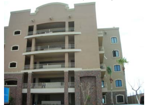
Above: Street-side view of Building A