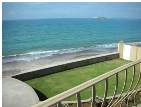
Above: View of the Sea of Cortez and Amenities area from Building A

Greetings from sunny San Carlos! So much construction progress has been made since our last newsletter! Building A is complete and is absolutely beautiful. The grounds are picturesque with bougainvillea, palm trees, colorful lantana and other native landscaping all around.