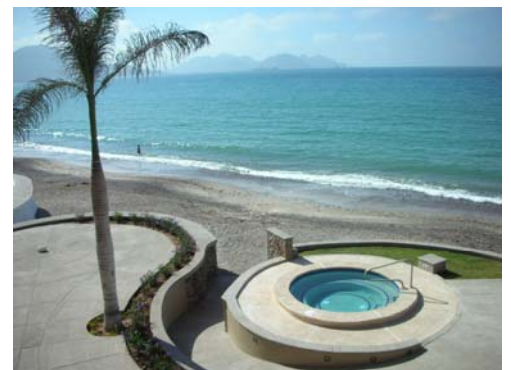
Above: Spa and beach access at Building A